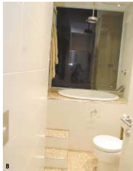
A The front room was opened up and the staircase modernised B The architects slotted in a bathroom upstairs with a Japanese tub C The distinctive balustrade had to be kept in character for heritage purposes

MORE INFORMATION: If you’re tossing up between buying or building, check out Peter’s online guide Buy or Build at www.peterdaltonarchitects.com.au . The website also features a house design budgeting tool to help you work out what you can afford.